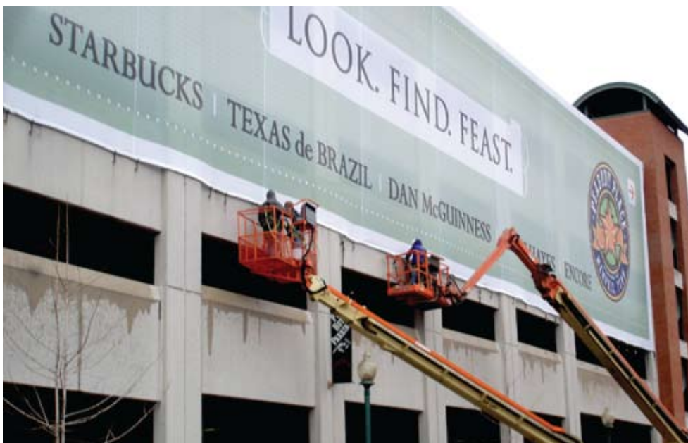
Belz (Memphis, TN)

Get on track for your next big project with Britten's Nationwide Installation Team!