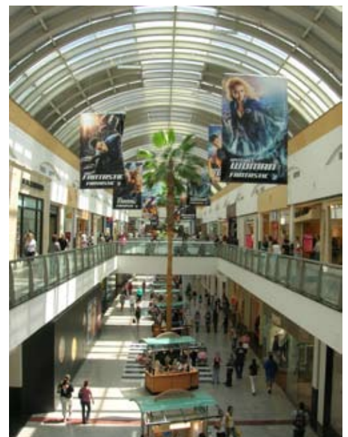
Northridge (Los Angeles, CA)

Nationwide Installation. For complex displays, your turnkey solution can include on-site installation. Our installation teams are located across the U.S. and can come to you , wherever you have an opportunity to influence your target audience. Expert installation means your banners & signage look great and go up on schedule...without unforeseen hassles!