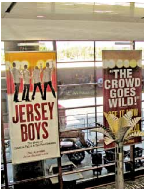
McCarran International Airport (Las Vegas, NV)

– Shopping mall development company, Laurel, MD