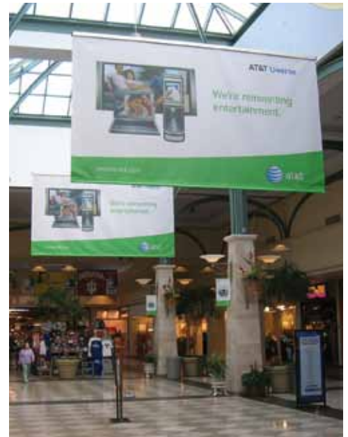
Castleton Square (Indianapolis, IN)

Now this is easy: Hit a remote-control button and old banners come down, new banners go up – way up... as high as 60 feet – staying smooth and level. Britten's patented BannerDrop® makes it happen.