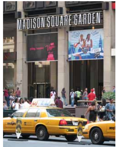
Madison Square Garden (New York City, NY)

Like magic, Britten's BannerDrop lowers costs and raises revenues. Our customers report additional earning potential from banner ads of $12,000 per month and over $15,000 in lift-rental savings per year. Typically, BannerDrop saves customers an average $1,800 every time an ad changes!