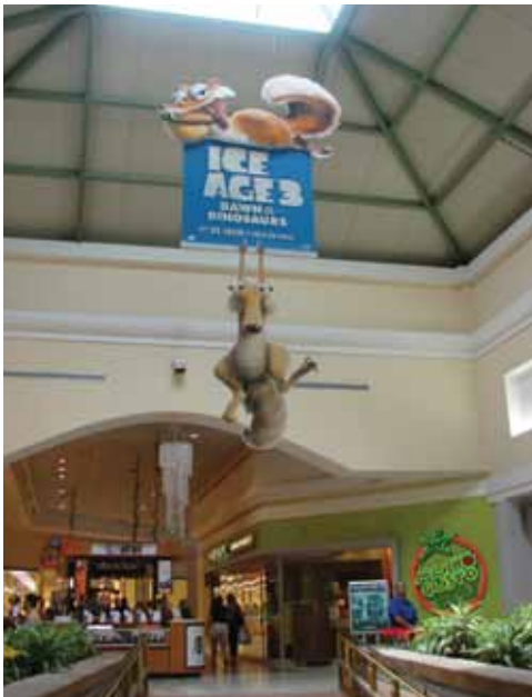
Montehiedra Mall (San Juan, PR)

Put Ceiling Space To Work with the Push of a Button. Britten's Revolutionary BannerDrop® Hoists Banners Hassle-Free, Lift-Free.