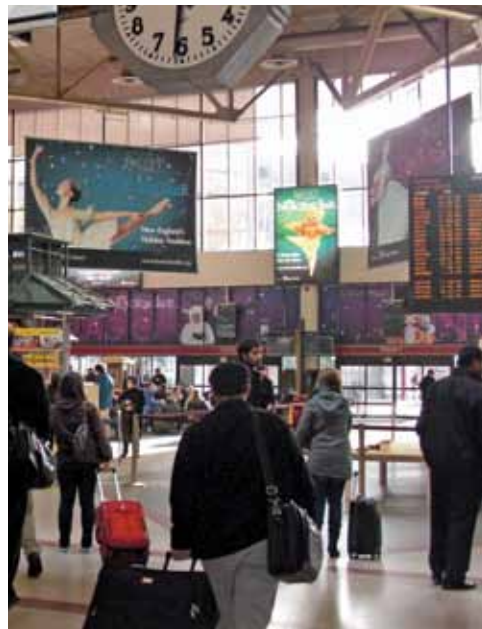
South Station (Boston, MA)