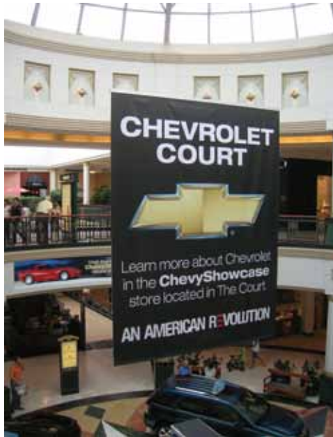
King of Prussia Mall (Philadelphia, PA)