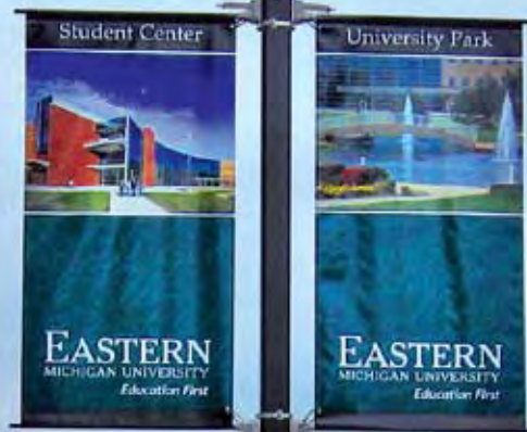
Picture Illustrates Heavy Banding