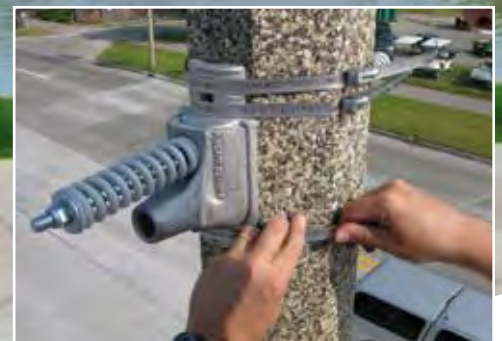
Picture Illustrates Standard Banding