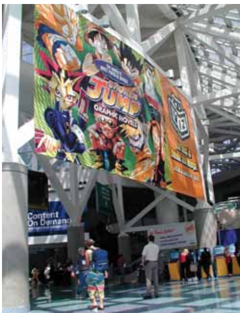
Las Vegas, NV

From One-of-a-Kind Banners to High-Volume Orders – and Everything in Between – Britten Makes it Happen with High-Powered Technology and Fired-Up Service.