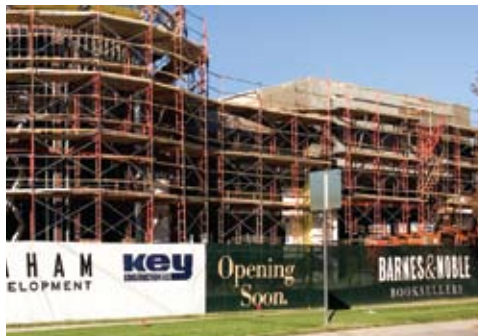
Bradley Fair (Wichita, KS)