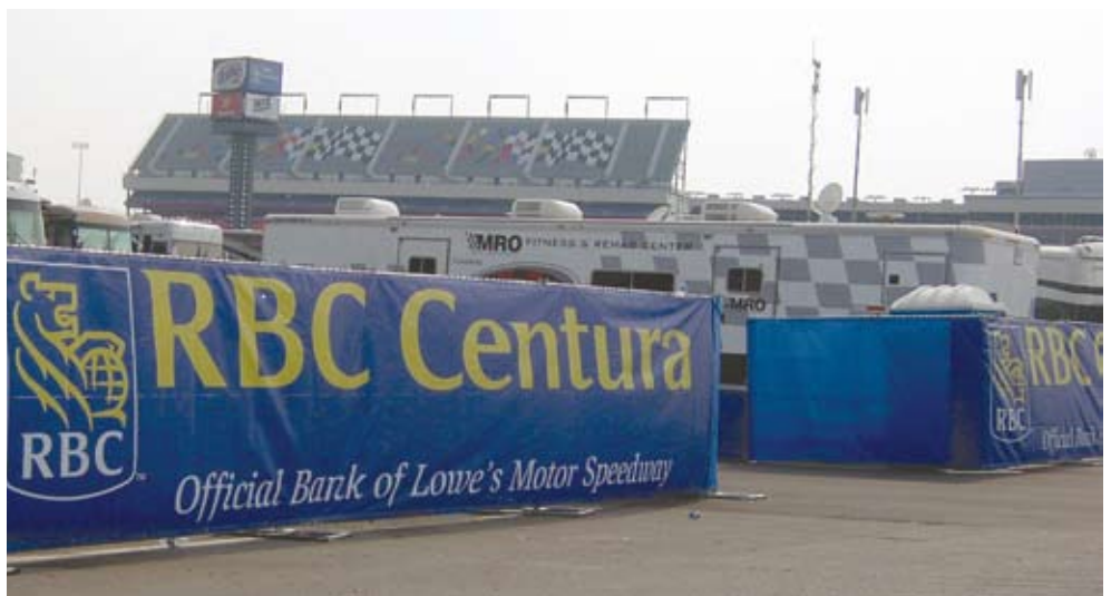
Lowe's Motor Speedway (Concord, NC)