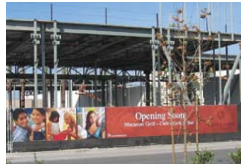
Otay Ranch (Chula Vista, CA)

Ready to go? Want to learn more? Call us toll-free 24/7 at 1-800-426-9496 or visit www.BrittenBanners.com