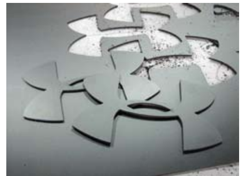
Three-dimensional, rigid stock