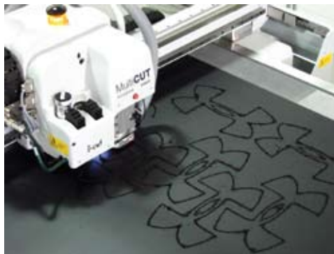
Precision routing and cutting